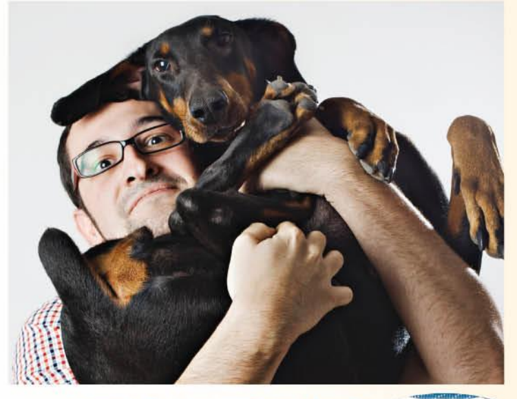
© 2010 VetThink, Inc. www.Genesis4Pets.com (Genesis